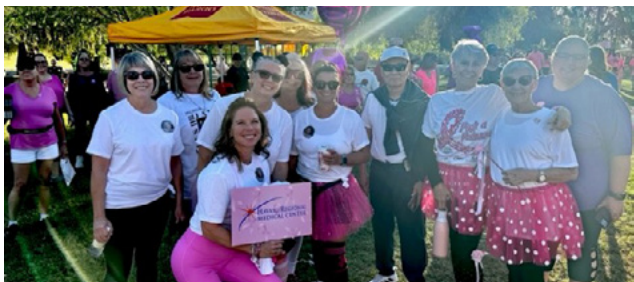
HRMC was proud to support the Cancer Association of Havasu for their annual Breast Cancer Awareness walk.