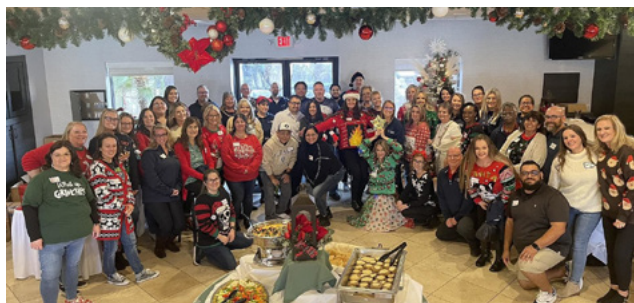
HRMC and sister hospital, Valley View Medical Center, partnered with Mohave Community College for a Market Leadership Development conference.